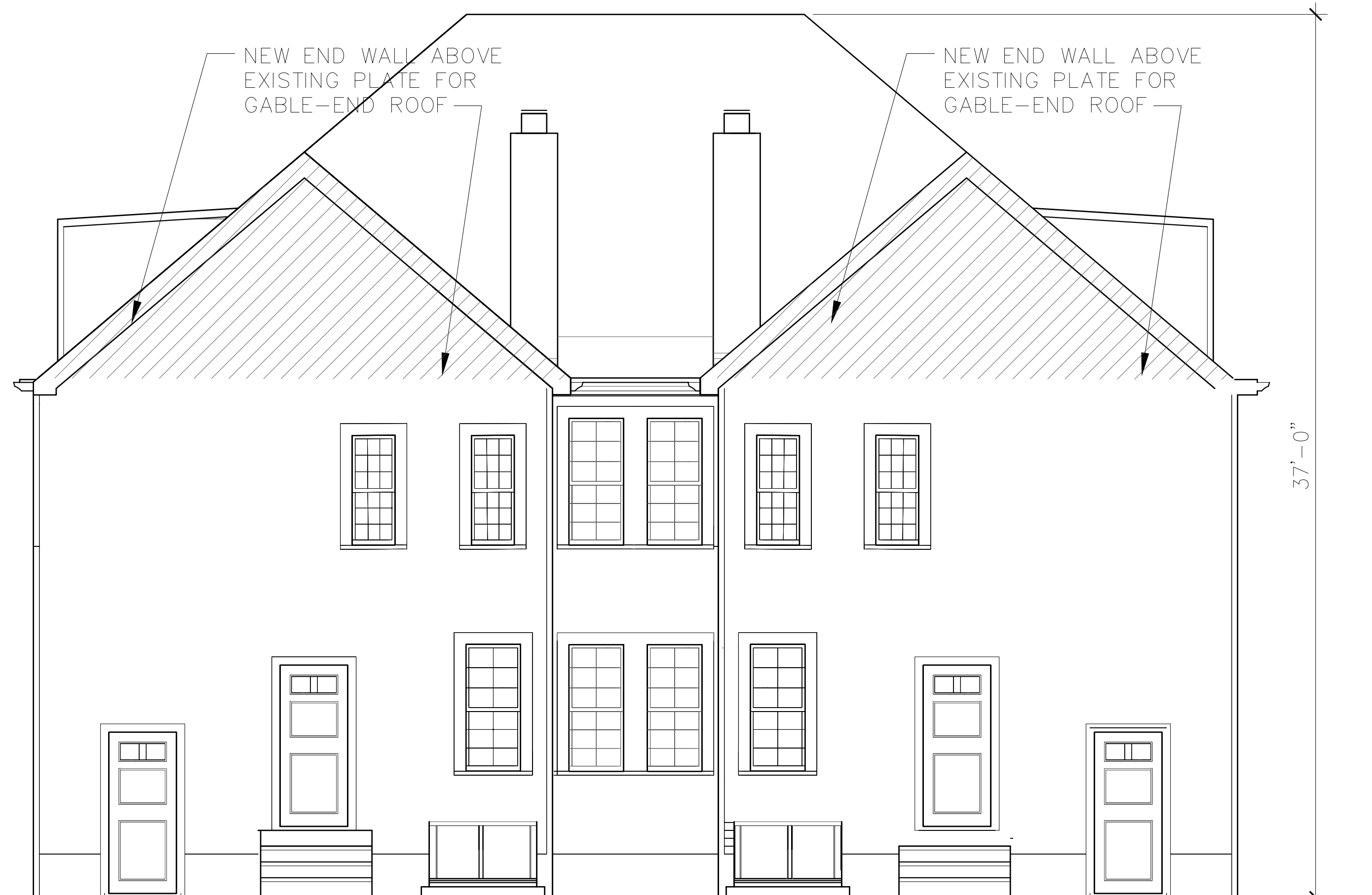
2 A1 PROPOSED REAR ELEVATION 1/4" = 1'-0"