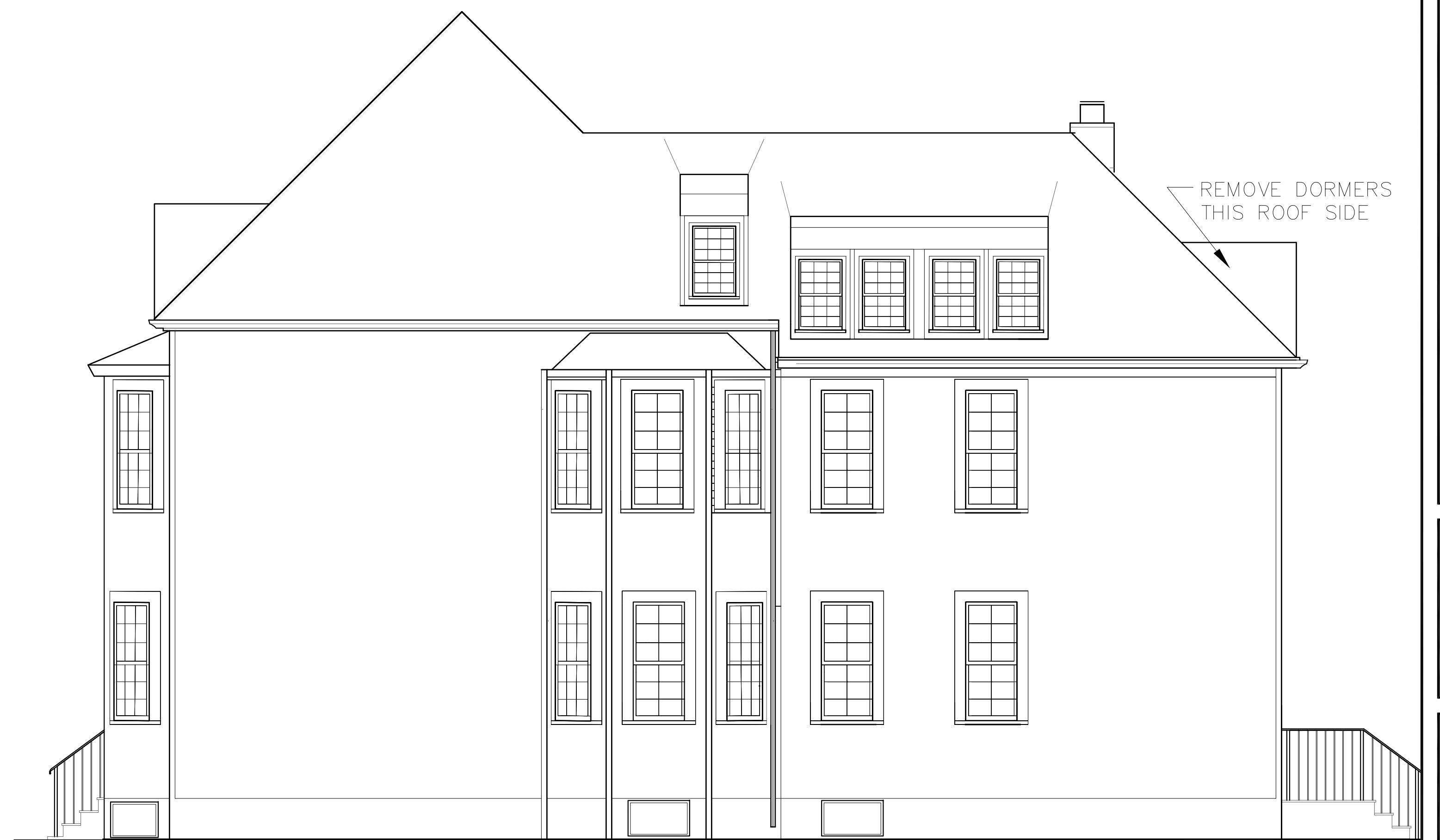
3 A1 EXISTING RIGHT SIDE ELEVATION