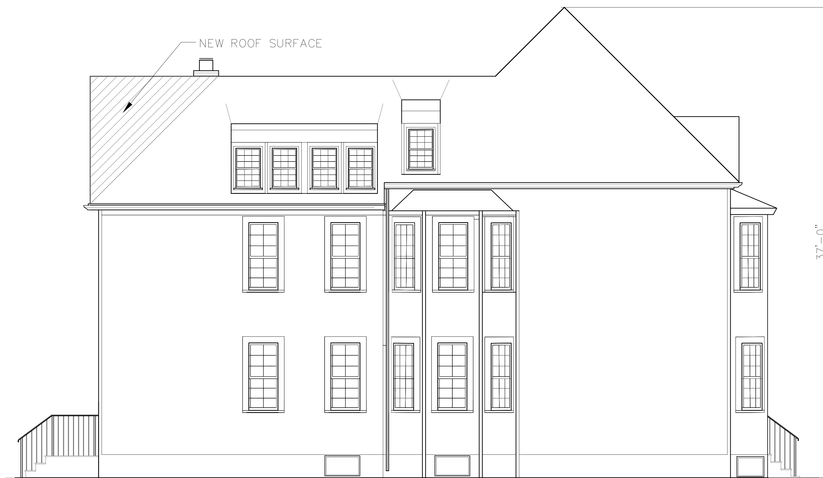
2 A2 PROPOSED LEFT SIDE ELEVATION