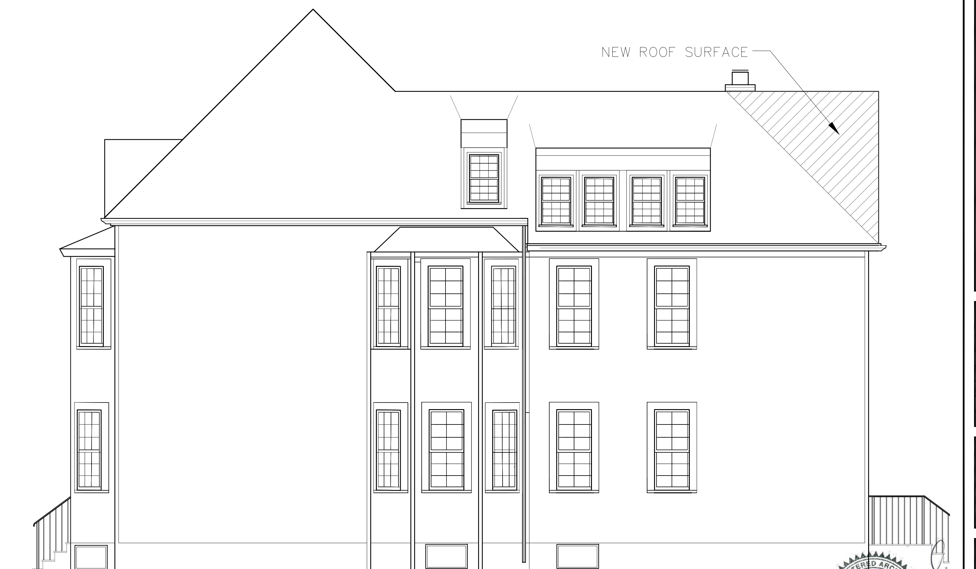
4 A1 PROPOSED RIGHT SIDE ELEVATION

PAUL R. LESSARD • REGISTERED ARCHITECT • 18 LEAVITT STREET SALEM, MA 01970 paul@paularchitect.com (978) 210-1960