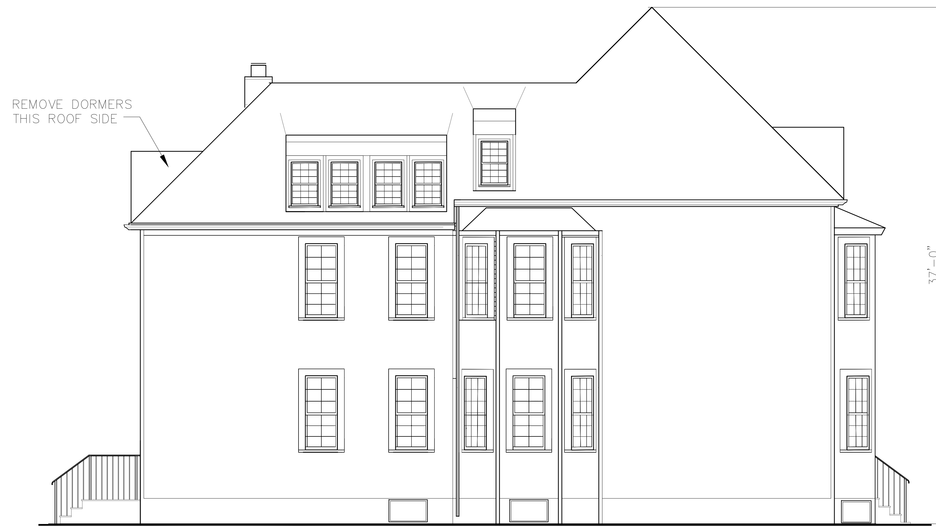
1 A2 EXISTING LEFT SIDE ELEVATION